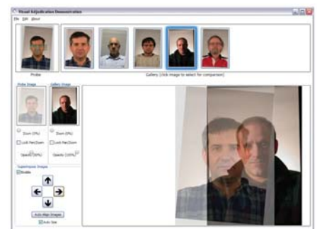
Fig. 4 Superimpose Face Images

Trusted Identity Assurance & Credentialing