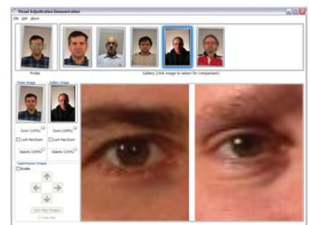
Fig. 3 Zoom on Face Features