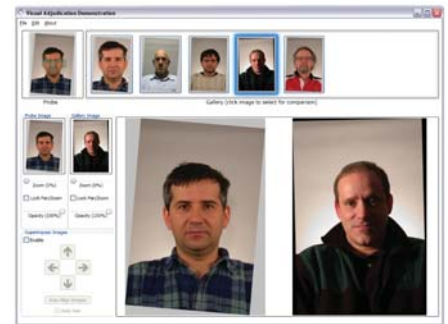
Fig. 2 For Visual Adjudication

For more information on the BIOcheck , a NextgenID product, or to purchase any NextgenID® products, please contact NextgenID® or email us at sales@nextgenid.com .